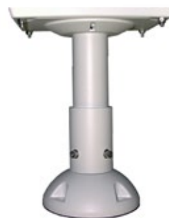
Ceiling / Pendant Mount